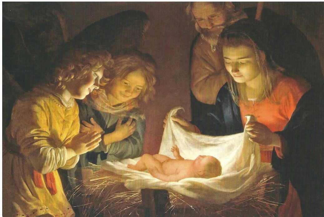
Gerrit van Honthorst, "Adoration of the Child", about 1620